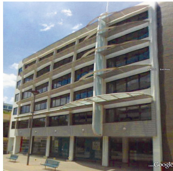
The building at 4 Mort Street in Braddon, Australian Capital Territory.

The information in this Case Study is for the use of ecoBright® customers. ecoBright® shall not be held liable for any costs, losses or damages howsoever caused as a result of reliance on the information it contains. For advice or more information on ecoBright® products and applications please contact staff at: