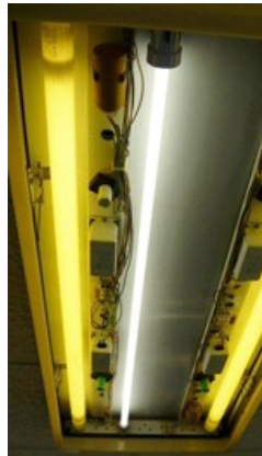
Swapping their old yellowing T12 lamp for the Cool White colour of T5 gives the office a new look.

"We're limited in what we can do with SBN due to our own time constraints, but we wanted to affirm