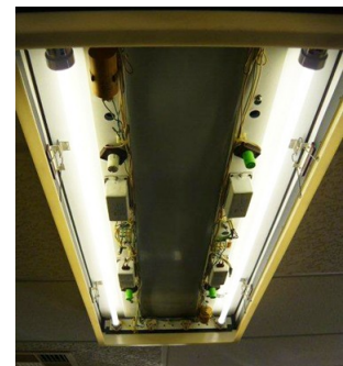
Four lamp T12 lamp fitting reduced to two new technology T5 lamps.