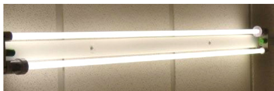
Retro-fitted T8 luminaires with electronic T5 fluorescent lamps positioned centrally using the Save It Easy® in-line T5 adaptor at SKY Mt Wellington offices in Auckland.

"When ecoBright® showed us Save It Easy®, we saw the advantages through both cost savings and in the guaranteed 25% minimum energy savings offered. We installed a trial upgrade to determine the product's suitability with our existing T8 fittings and