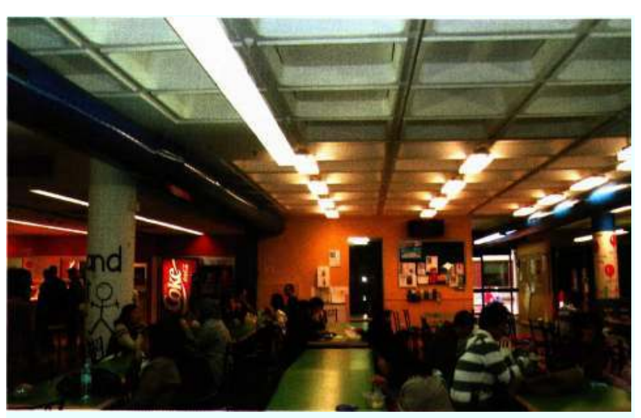
One year after undergoing a green lighting refit, VU has reportedly saved more than $73,000 on its energy bill and reduced its greenhouse gas emissions by 470 tonnes.