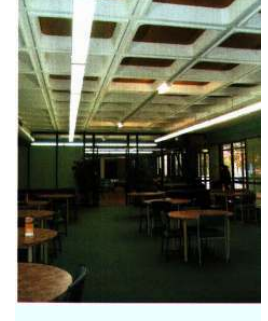
VU invested $250,000 in the lighting refit, with an estimated payback time of 41 months.